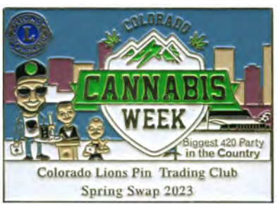
FG 0354 23 Colorado Pin Traders Cannabis Week